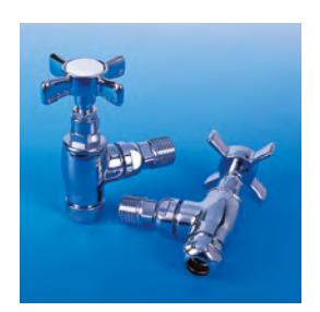
Chrome Belgravia 15mm Valve