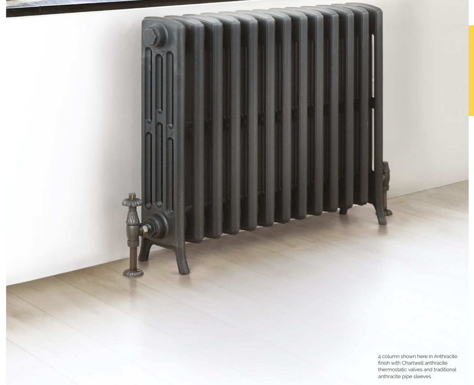
4 column shown here in Anthracite finish with Chartwell anthracite thermostatic valves and traditional anthracite pipe sleeves.